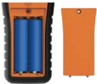
Battery Replacement Diagram